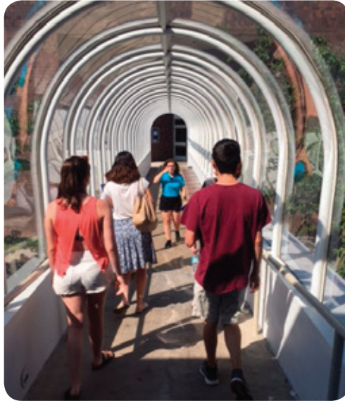
Students touring the University of Rochester.

Our students are taking the initiative to visit campuses, speak to admissions representatives, and shadow potential careers. From this moment forward, they have the opportunity to propel themselves toward a future education and career path. Your children and our students are growing up fast; however, they still need all of our encouragement, especially the undecided students. My favorite part of the job is learning more about each young person and helping them explore what's beyond high school and Byron-Bergen.