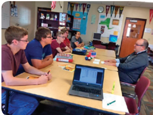
Students meeting with admission representative from Canisius College.