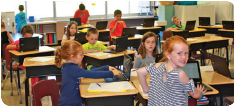
Third-grade students work on Chromebooks.

Our grade 3-6 classrooms will each have full class sets of Chromebooks allowing for one-to-one access for all students simultaneously. By third grade, students are much more proficient with technology and are able to use the Chromebooks in more sophisticated ways to bolster learning.